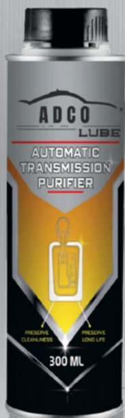
AUTOMATIC TRANSMISSION PURIFIER

Adco Transmission Flush add extra performance and cleaning effect for the automatic transmissions. Its potent, detergent- based formula cleans sludge and deposit build-up.