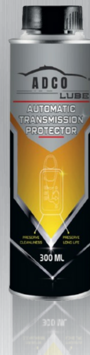
AUTOMATIC TRANSMISSION PROTECTOR