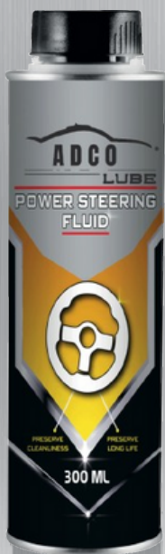
POWER STEERING FLUID

Power steering fluid synthetic formula crafted to provide long, trouble-free service in most domestic and foreign passenger cars and light trucks, delivers excellent lubricity and friction-reduction properties. As a result, power steering pump components and hoses receive maximum protection against wear and stress for long life and reliable performance.